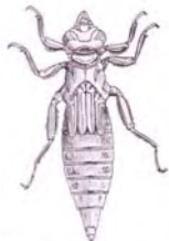
Figure 3. Rapids Clubtail male larva (COSEWIC 2008, from Walker 1932)

Contact the MNR to determine if a permit is required under the Endangered Species Act, 2007 to conduct sampling and identification protocols.